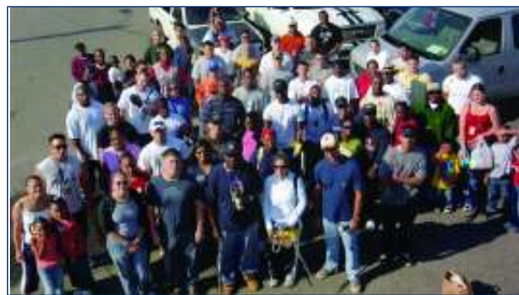
3rd Place Outstanding Organization USS Harry S. Truman Group picture Clean the Bay Day 2006