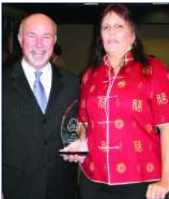
1st Place Mayor's Outstanding Award Scout Troop #244 Cradock