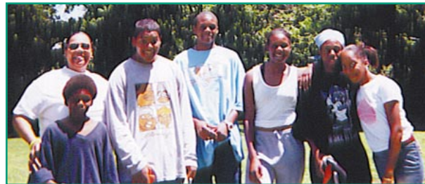
Above: Port Norfolk and PRIDE Students Below: Swimming Point