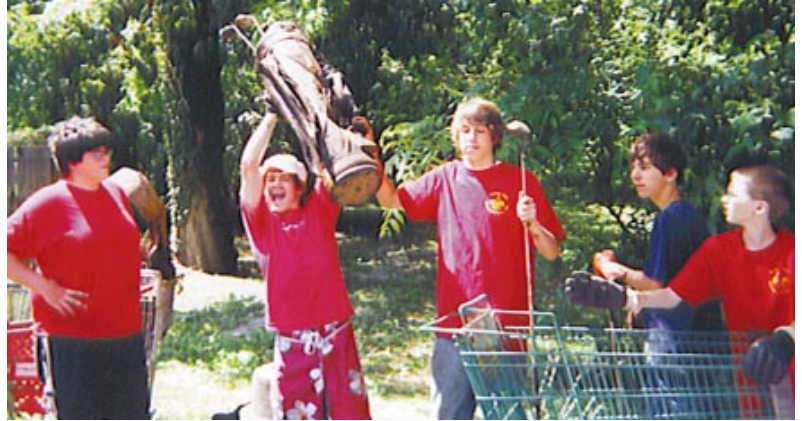
Boy Scout Troop 259 found a full set of golf clubs at City Park.