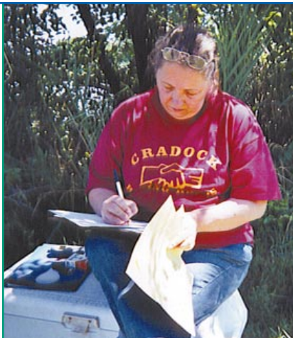
Above: Paradise Creek, Cradock