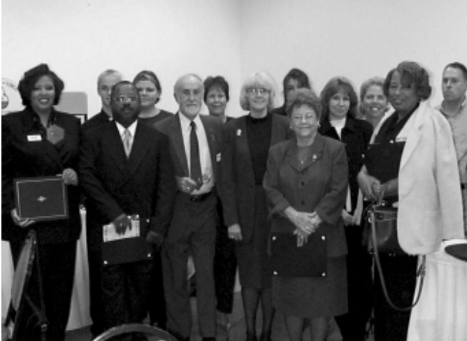
Adopt-A-Spot participants awarded at the 2000 Recognition Banquet

Clean Community is gearing up for a great new year. Our calendar is already filling up with plans for a major gateway beautification project, the Great American Clean Up in spring of 2001, and a new fundraiser. We will continue to team up with our Clean Community partners, Coca Cola and our newest partner, Coleman's Nursery. Thank you for your part in making this a successful year for us. Happy Holidays.