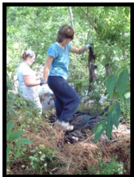
above: Volunteers at Paradise Creek