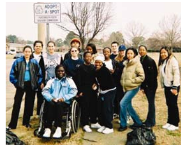
Above: Mayors Youth Advisory Commission clean their Adopt-A-Spot.

ing together individuals who consolidate and make a difference. Are you missing out? Why not Adopt-a-Spot?