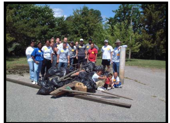
Above: Volunteers at Scotts Creek

To volunteer, call 393-5628; 1-800-SAVEBAY, or log onto www.cbf.org/clean .