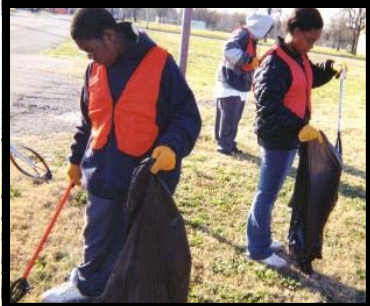
Upper left: Weed and Seed volunteers