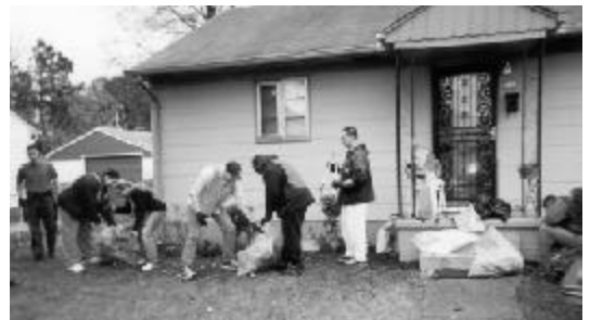
Operation Clean Up Portsmouth - Cavalier Manor 2001

*Winning communities will be awarded a prize based on the number of bulk collected.